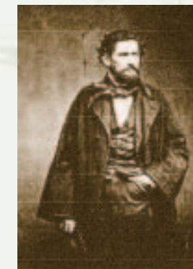
Hays was a Texas Ranger captain and army military officer who served in several conflicts, including the Mexican War.

He devoted much of the rest of his life to acquiring and developing property in Berkeley, Oakland, Alameda, and what was to become Piedmont. When Jack Hays died at his home on April 21, 1883, newspapers were filled with accounts of his passing. The funeral procession wound its way out Broadway as crowds lined the streets all the way to Mountain View Cemetery. Fernwood was destroyed by fire in 1899, but a stone foundation along Thornhill Drive and Mountain Boulevard remains today as a reminder of the once-great estate. 🙏