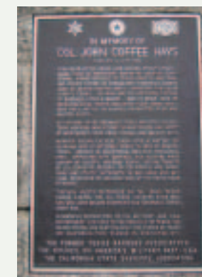
This plaque is displayed where Hays is interred in Plot 2, Lot 15, at Mountain View Cemetery.