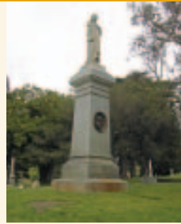
The Ryer monument is the tallest and most impressive monument on the south side of the cemetery.

The tallest and most impressive monument on the south side of Mountain View Cemetery is that of Dr. Washington M. Ryer (located in Plot 9, Lots 33–40). Massive chunks of granite bearing a bronze portrait of Ryer are topped with a larger-than-life statue of a woman gazing south over the city of Oakland. She is wrapped in draperies and is carrying a book in her right hand; a closed book generally represents a life ended. No details about the creation or placement of the monument are known, but it must have taken many horses and men to place it over Ryer’s grave.