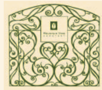
Our new entryway gates will feature a soft floral pattern.

If you’ve visited the cemetery during the past two years, it’s been difficult not to notice the temporary construction gates at the cemetery entrance. We are pleased to announce that new gates are on the way!