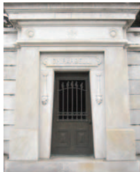
You can visit Ghirardelli's white marble mausoleum in Plot 27, Lot 40.

Domingo Ghirardelli died in his birthplace, Rapallo, Italy, during an 1894 visit there. His body was returned for interment in his white marble mausoleum in Plot 27, Lot 40, at Mountain View. 🙏